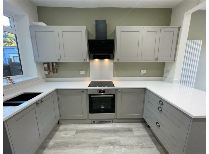
Rear Reception Room