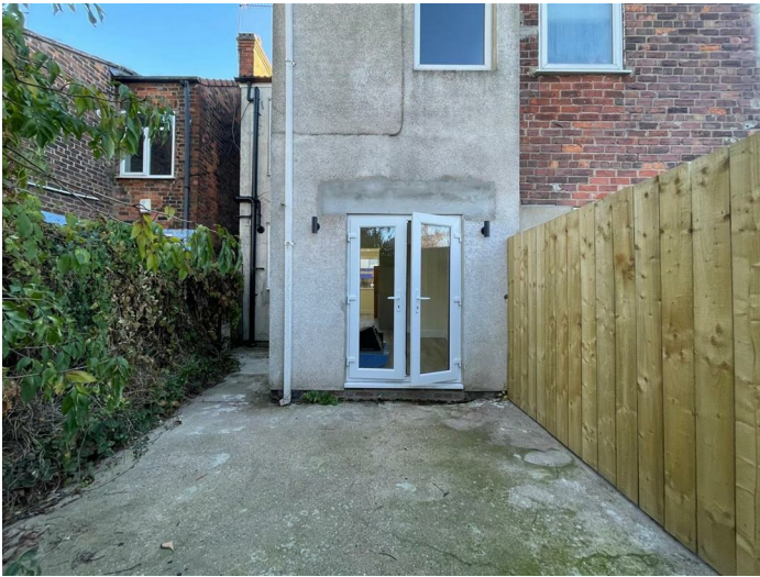
Stairs and Landing