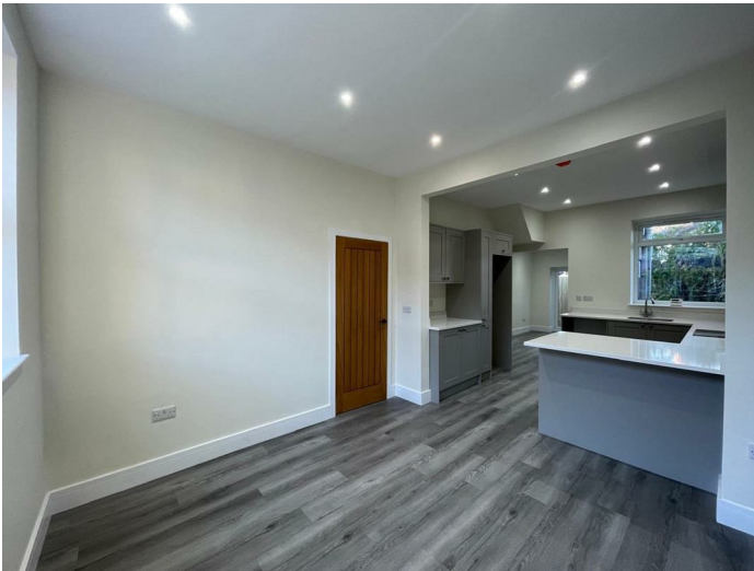
Open plan to kitchen